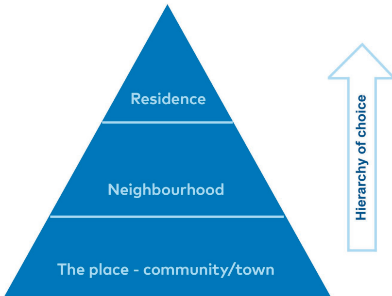
Figure 2. Hierarchy of choices when choosing to buy or build a new house, according to the Norwegian Institute for Urban and Regional Research.

This kind of place-based perspective opens up a range of options for local authorities and local people – a window of opportunity to exert influence on their housing markets despite general trends, if you like. That includes factors such as job opportunities, attractive natural surroundings, service and transport infrastructure, social and cultural activities, plus the overall 'attractiveness' of a given area. All this provides a whole new role for local actors as we shall see in the next section.